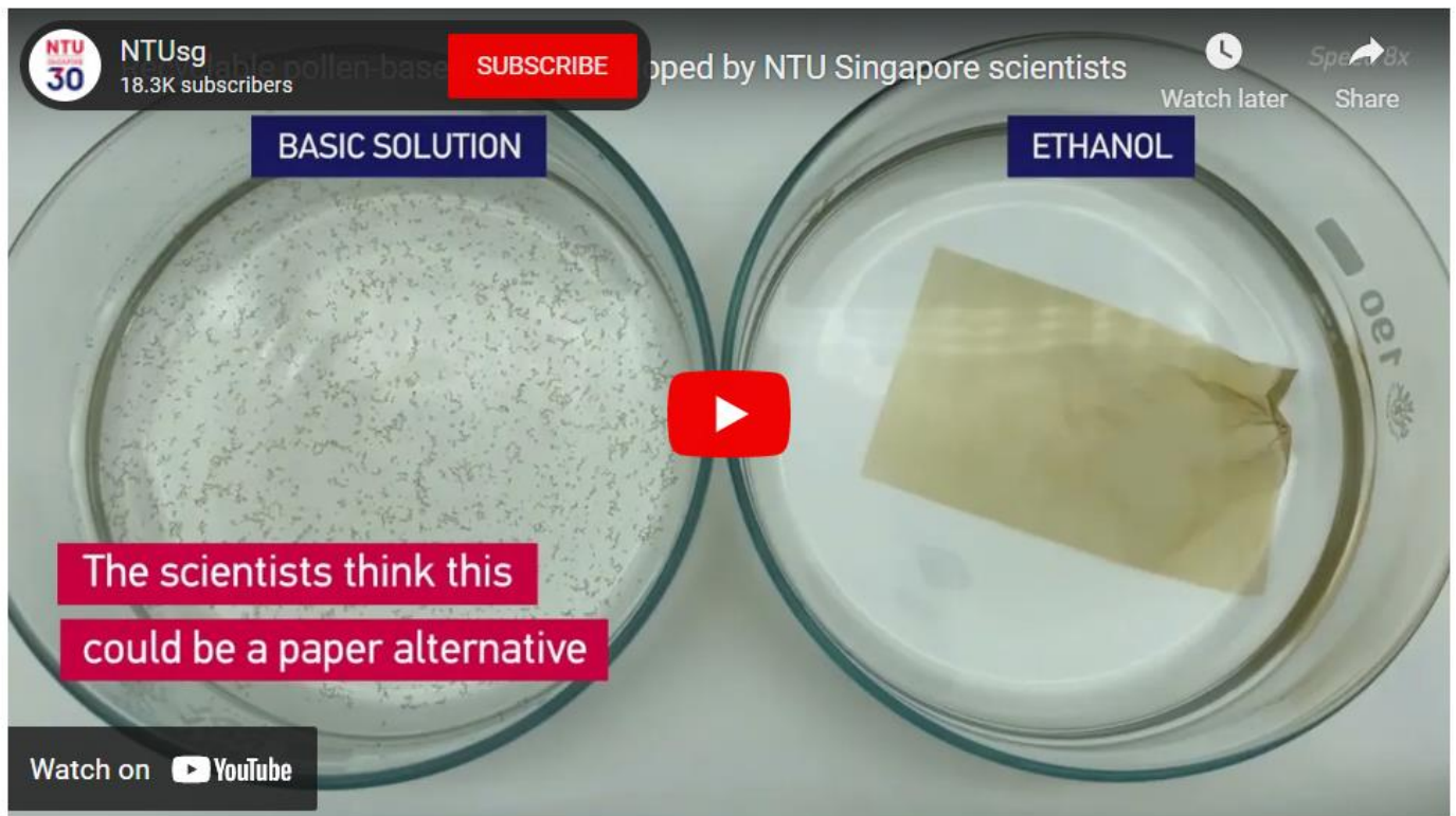
Recyclable pollen-based paper developed by NTU Singapore scientists